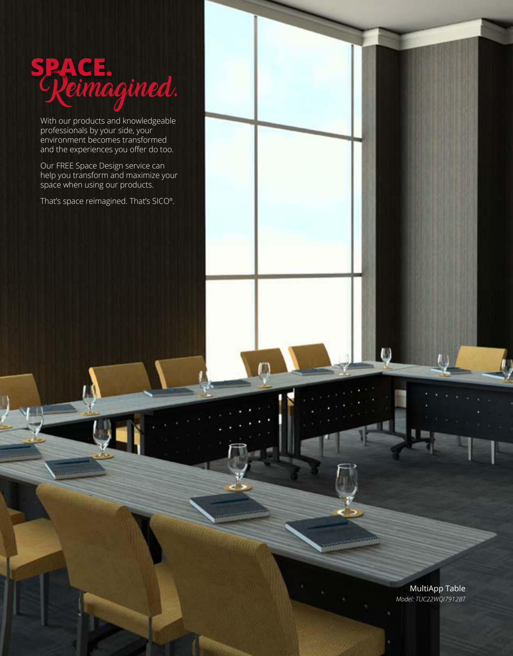
MultiApp Table Model: TUC22WQI7912BT