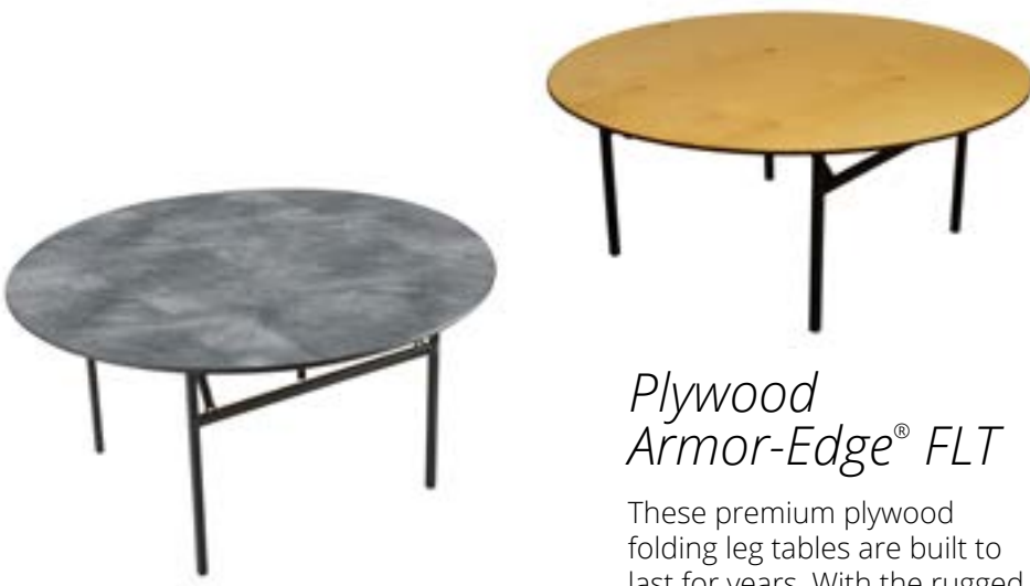
Plywood Armor-Edge® FLT

These premium plywood folding leg tables are built to last for years. With the rugged Armor-Edge®, heavy-duty legs, aircraft lock-nuts and bolts, and expansion rivets instead of screws, SICO's plywood tables provide years of trouble-free operation.