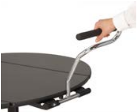
Table Guide (Optional)

Choose a larger 5" resort caster for easy rolling over rough terrain. Constructed for durability and easy cleaning. One person can easily roll and maneuver tables.